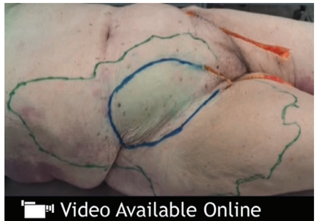
Video Graphic 1. See video, Supplemental Digital Content 1, which displays the groin region under visualization with the near-infrared camera after injection of 2.5 ml ICG solution and 2.5 ml methylene blue solution into the SCIA, http://links.lww.com/PRSGO/A543 .

The findings seem to confirm the fact that postmortem studies with methylene blue generally rather under- than overestimate the maximum vascular territory. 10 The FA produces a clear image of the potential skin paddle with well-defined borders. Paired with its excellent staining properties, which require only a low volume to completely