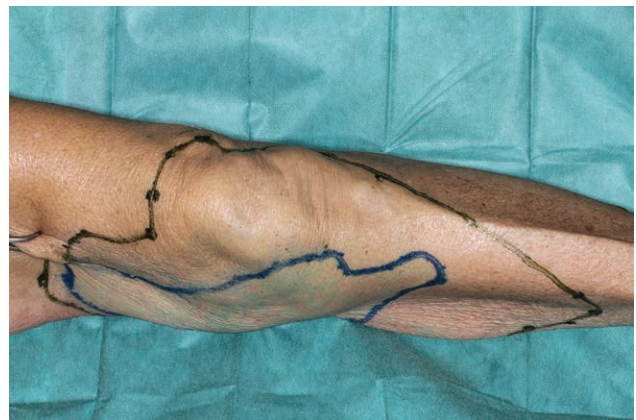
Fig. 3. Comparison between the staining properties of methylene blue and ICG marked on the medial thigh.